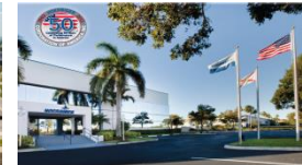
HOERBIGER Corp. of America, Inc.* 3350 Gateway Drive, Pompano Beach Florida, 33069 / 1212 Milby Street, Houston Texas, 77023