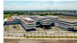
HOERBIGER Ventilwerke GmbH & Co. KG Seestadtstraße 25, 1220 Vienna Austria