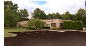
HOERBIGER Engine Altronic, LLC* 712 Trumbull Avenue, Girard Ohio, 44420